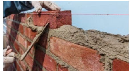
PORTLAND LIME & SAND MORTAR

Available in standard or custom colors. Don't need preblended colored mortar? Our WORKRITE colored cements are always available.