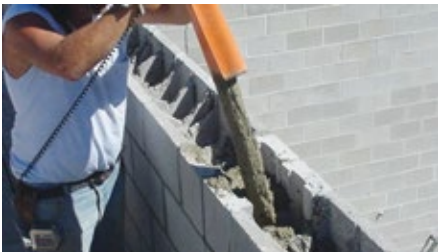
CORE FILL GROUT

WE NOW STOCK SELECT SPEC MIX ® PRODUCTS FOR EASY DELIVERY TO YOUR PROJECTS