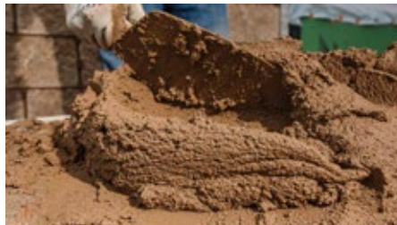
MASONRY CEMENT & SAND MORTAR (M, S, N)

Formulated for superior flow to fill masonry voids and achieve required compressive strength, while meeting ASTM C 476 and CSA A179 requirements for reinforced masonry construction.