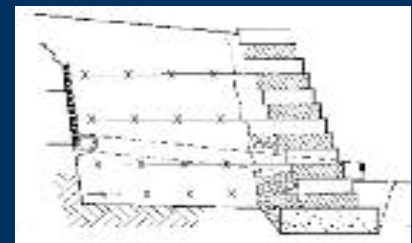
Retaining Wall Interceptor Drain

TenCate™ Geosynthetics North America assumes no liability for the accuracy or completeness of this information or for the ultimate use by the purchaser. TenCate™ Geosynthetics North America disclaims any and all express, implied, or statutory standards, warranties or guarantees, including without limitation any implied warranty as to merchantability or fitness for a particular purpose or arising from a course of dealing or usage of trade as to any equipment, materials, or information furnished herewith. This document should not be construed as engineering advice.