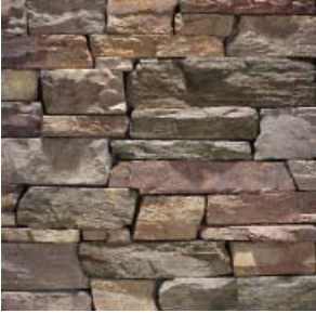
MANZANITA | Cliffstone

FOB - New Holland Facility 828 East Earl Road, New Holland, PA