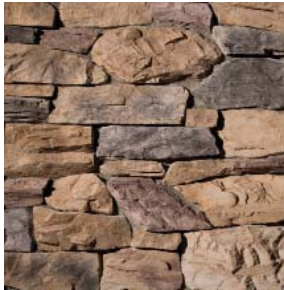
WILLOW | Shadow Rock