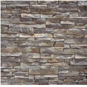
NANTUCKET | Stacked Stone