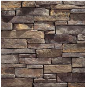
SIERRA | Mtn Ledge