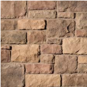
BRIDGEPORT | Limestone