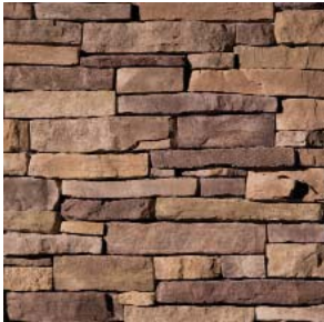
LEXINGTON | Mtn Ledge