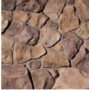
MILLSTREAM | Country Rubble