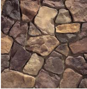
COGNAC | Country Rubble