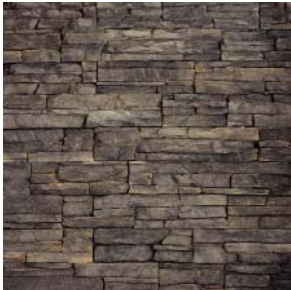
CHAPEL HILL | Stacked Stone