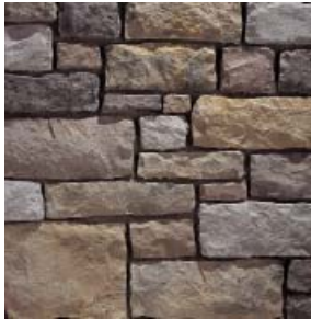
YORK | Limestone