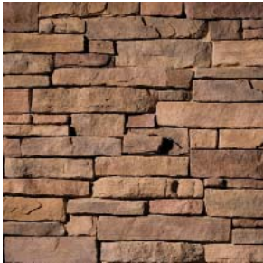
CHESTNUT RIDGE | Mtn Ledge