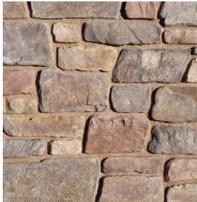
MESETA | Fieldledge