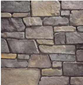
ANDANTE | Fieldledge