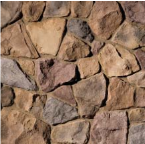
RIVER GORGE | Country Rubble