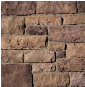
NEW HAVEN | Limestone