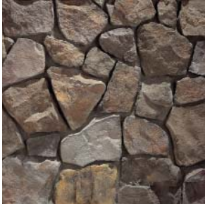
POLERMO | Country Rubble