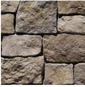
MOONLIGHT | Roughcut