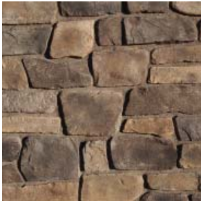
VENETO | Fieldledge