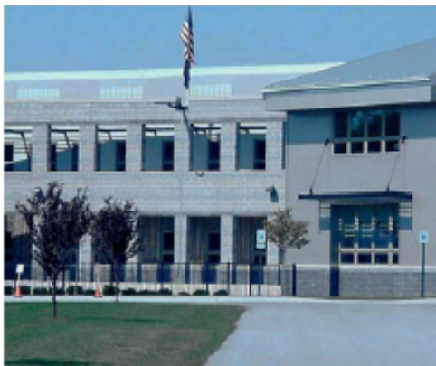
Clearview Elementary School Hanover PA LEED® Gold Rating (version 2.0)